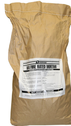
M4 Mortar bag